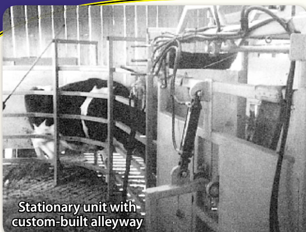
Stationary unit with custom-built alleyway

YES, there are "lower-cost" chutes out there — but ours gives you the most features for the money, AND will make working your cows a better experience for you and your cattle.