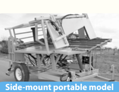
Side-mount portable model